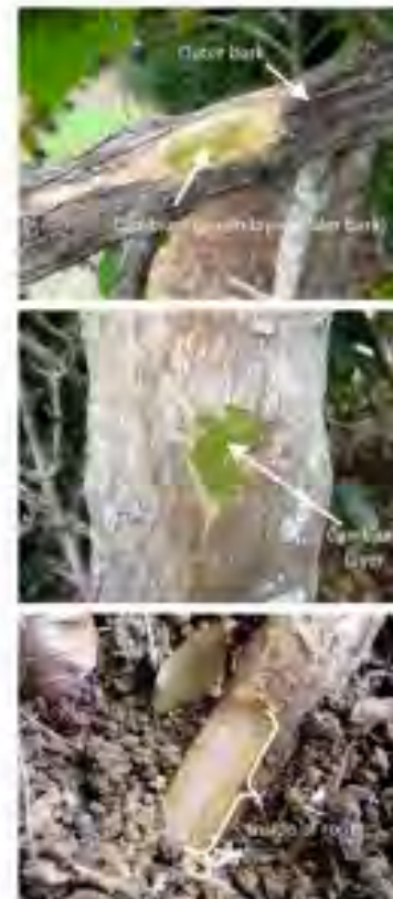
Figure 1: Coffee lateral (top) and stump (center) with bark removed, showing a thin, green layer of cambium cells. Healthy root (bottom) with exposed cortex and steel.

Step 7: Coffee cherries remaining on damaged plants may cause additional stress to the plant during recovery. Consider removing a large percentage of all cherries on trees with heavy cherry production, especially if very few to no leaves remain on the laterals. A plant without leaves or an insufficient amount of